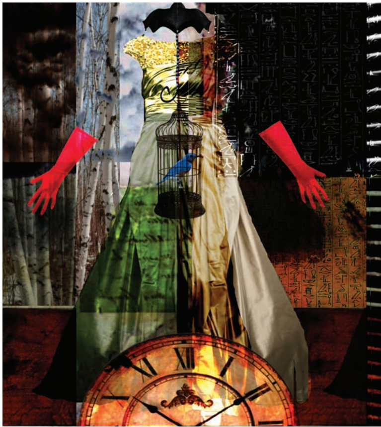
Birds Are Not The Target