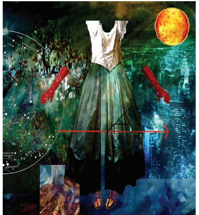
Formula of 2 Hands Clapping