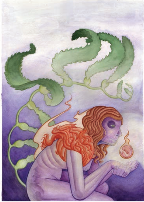
Lady in the Fronds