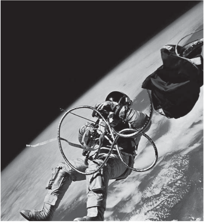
Historical EVA a few meters away from the cabin of the Earth-orbiting space shuttle Challenger NASA ID S84-27017 (Feb.. 7, 1984)